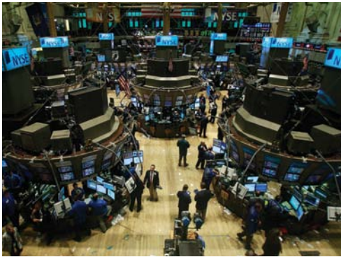
New York Stock Exchange